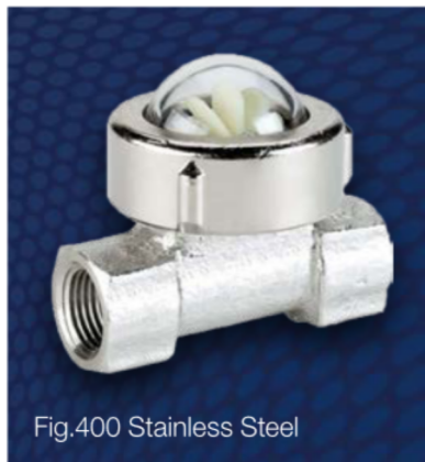
Fig.400 Stainless Steel

For product application please refer to pages 30 and 31.